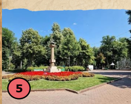
Stefan the Great Central Park